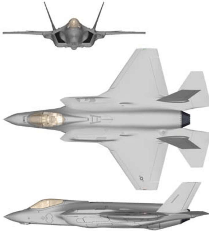
Figure 1. F-35 Lightning II Joint Strike Fighter

An additional 738 aircraft are expected to be ordered by the JSF development partner nations of the UK, Australia, Italy, Canada, Denmark, Turkey, the Netherlands, and Norway. 6 The United Kingdom is anticipated to be the largest foreign purchaser of the F-35, with a projected 138 STOVL aircraft.