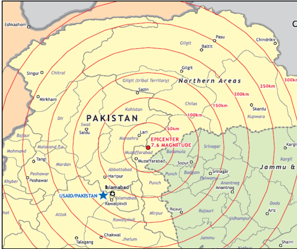
Map 2. The Epicenter and Political Boundaries