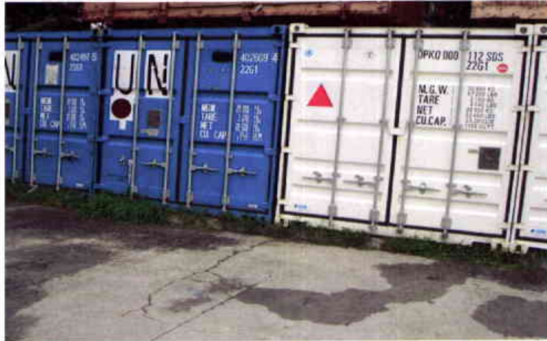
Figure 2 – Absence of locks on containers with UN assets

80. The audit also noted that no shelving was installed in Rubb Halls, and that assignment of storage bins and labeling of items stored had not been done. In addition, property items were stored in Rubb Halls and most of the containers in a disorderly manner. Some items, which had been received and inspected, were kept together with items still subject to the Receiving and Inspection (R&I) process. As a result, the process of locating and physically inspecting items, as well as reconciling items with the Galileo system records, was difficult and inefficient adding to the high risk of loss and theft.