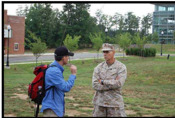
The "POLAD" makes a point to the maneuver commander