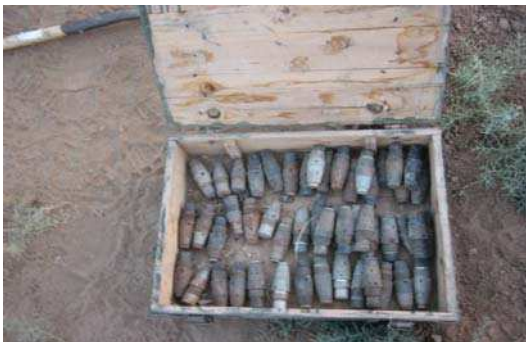
Can see inside the crate.