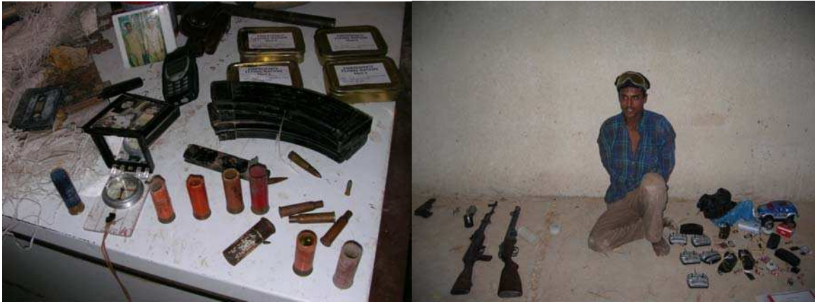
Shows how the items were found in house. Depicts the detainee with weapons.