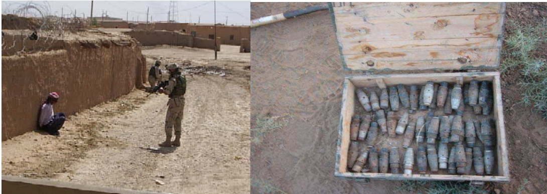
Shows where the detainee was captured.