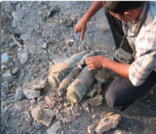
Shows EOD on scene.