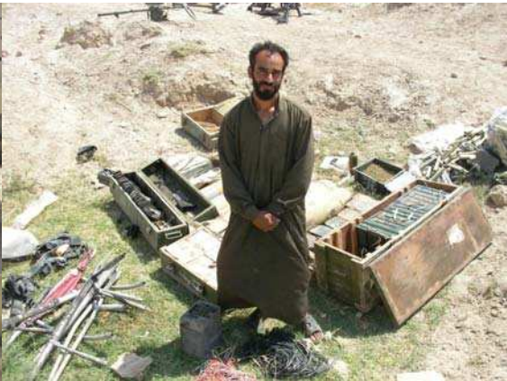
Detainee pictured with weapons. (A MUST!)