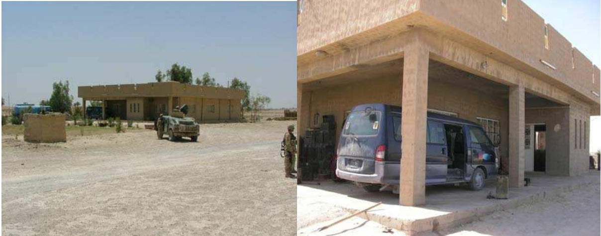
These two pictures show the detainees' residence and show where the raid occurred.