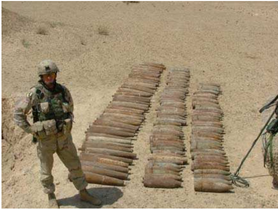
Depicts all of the ordinance found.