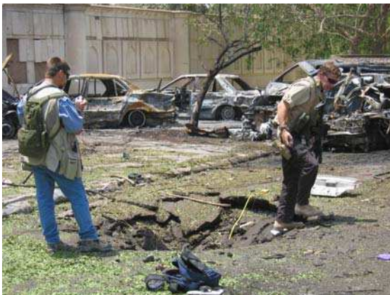
Shows where the explosion occurred.