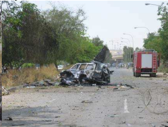
Shows the scene.