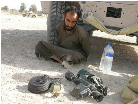
Detainee pictured with contraband.