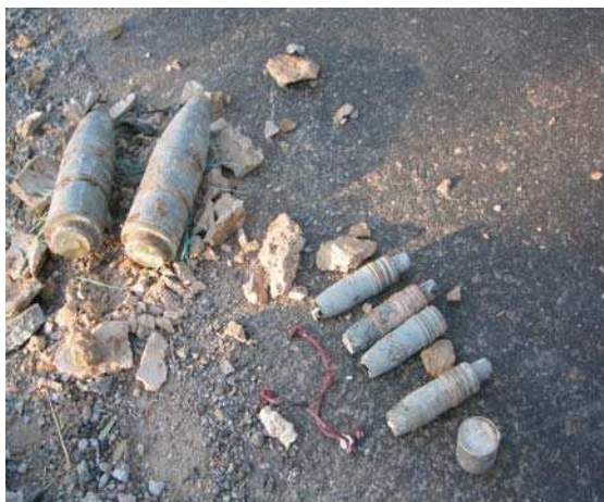
Shows the IED.