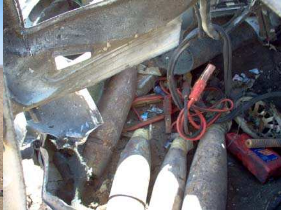
Shows the explosives.