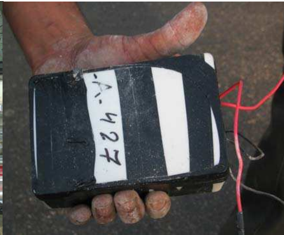
Shows the detonator.