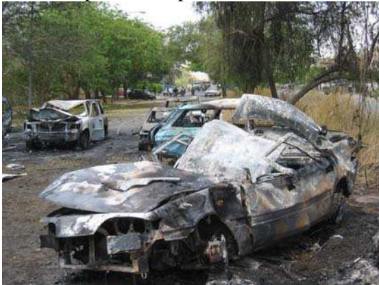
Shows the VBIED.