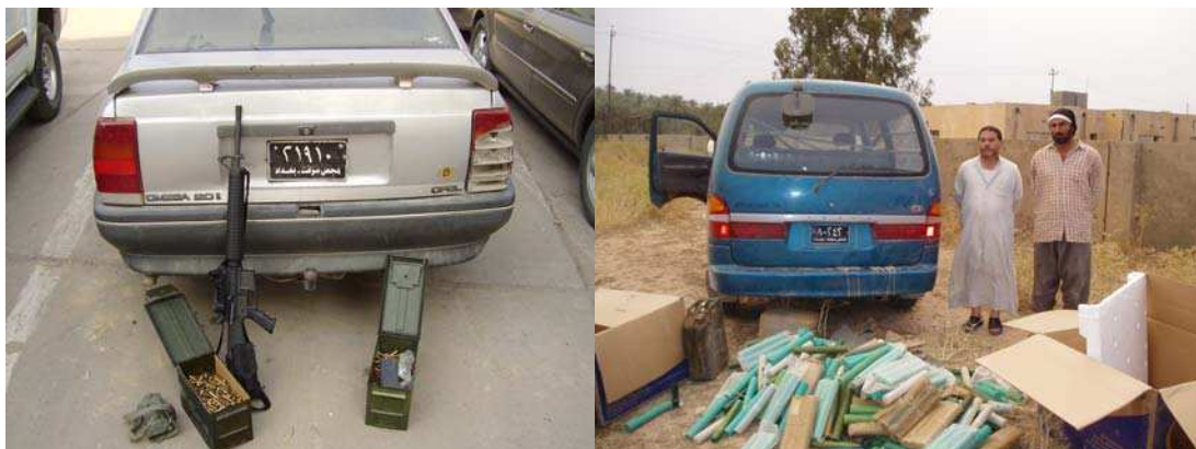
Shows license plate.