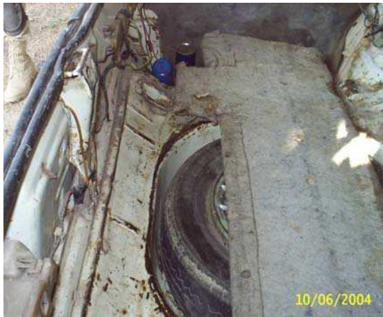
Shows the wiring of the VBIED.