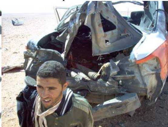
Depicts the detainee with VBIED.