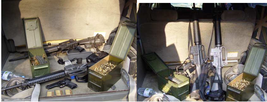
These two photographs show what is contained in the boxes.