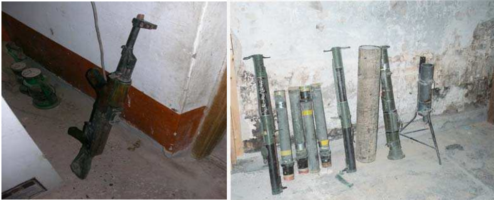
These two pictures show where the weapons were found in the home.