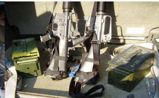
Can't see inside the ammo boxes