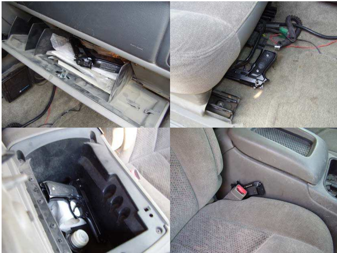
These four pictures show where the concealed weapon was found hidden in the vehicle.