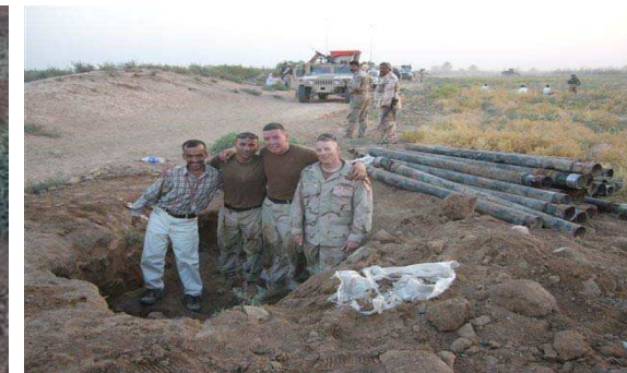
Make the photograph look professional.