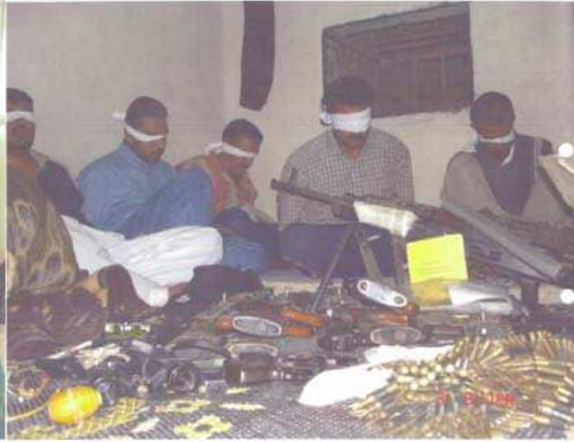
Can not see the faces.