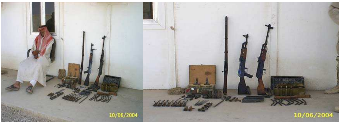
Depicts the detainee with the weapons (a must!).