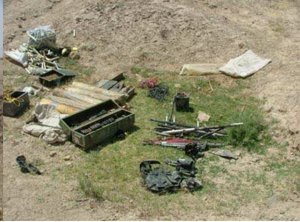
Depicts everything found.