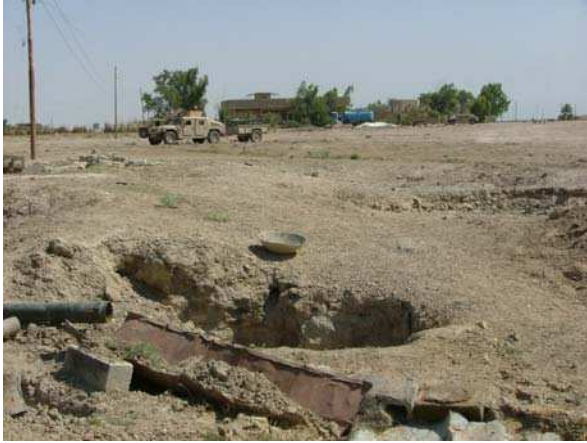
Shows house in relation to cache.