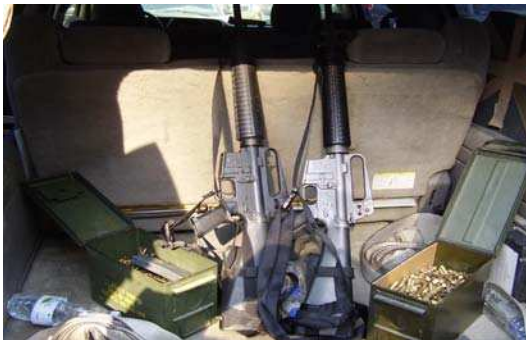
Can see inside the ammo boxes.