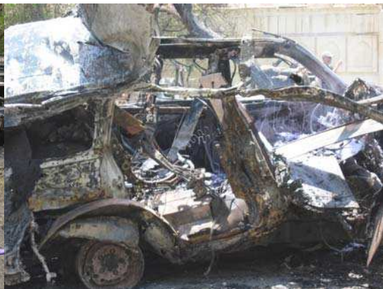
A close up.