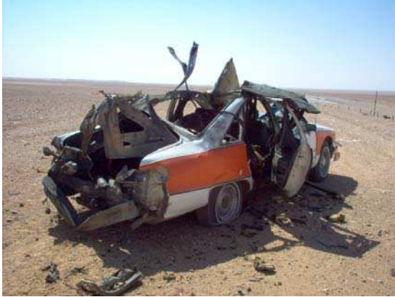
Shows the whole vehicle.