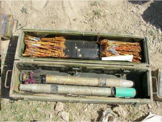
Good close up and the lid is open.