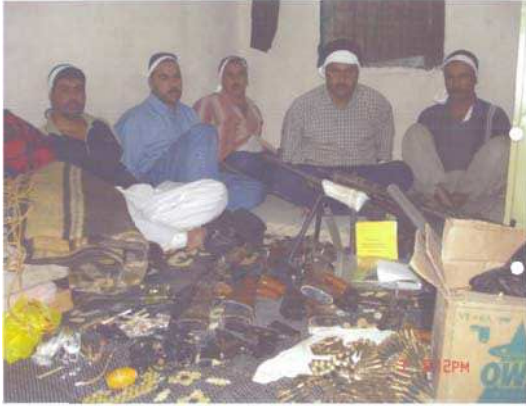
Can see faces.