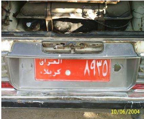
Shows the license plates.