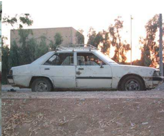
Depicts the VBIED and the scene.