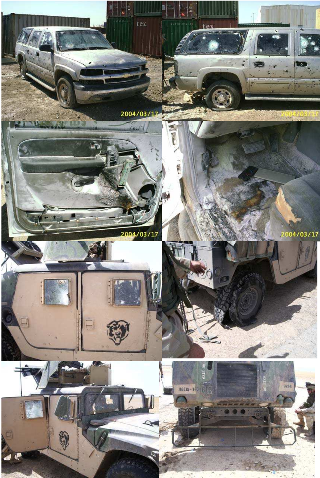
These pictures show the damage done to the Coalition Forces vehicle and prove that the attack actually occurred.