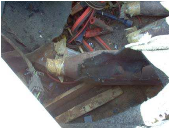
A close up of the explosives.